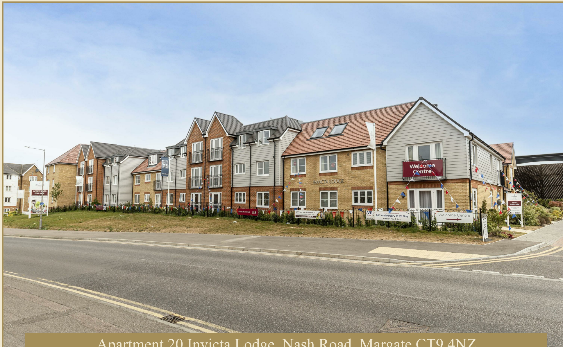
Apartment 20 Invicta Lodge, Nash Road, Margate CT9 4NZ